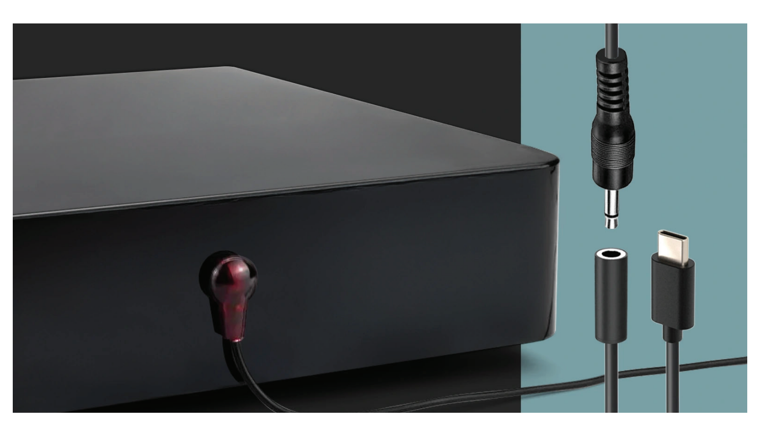
Use existing traditional emitters with the AVA Nano Brain